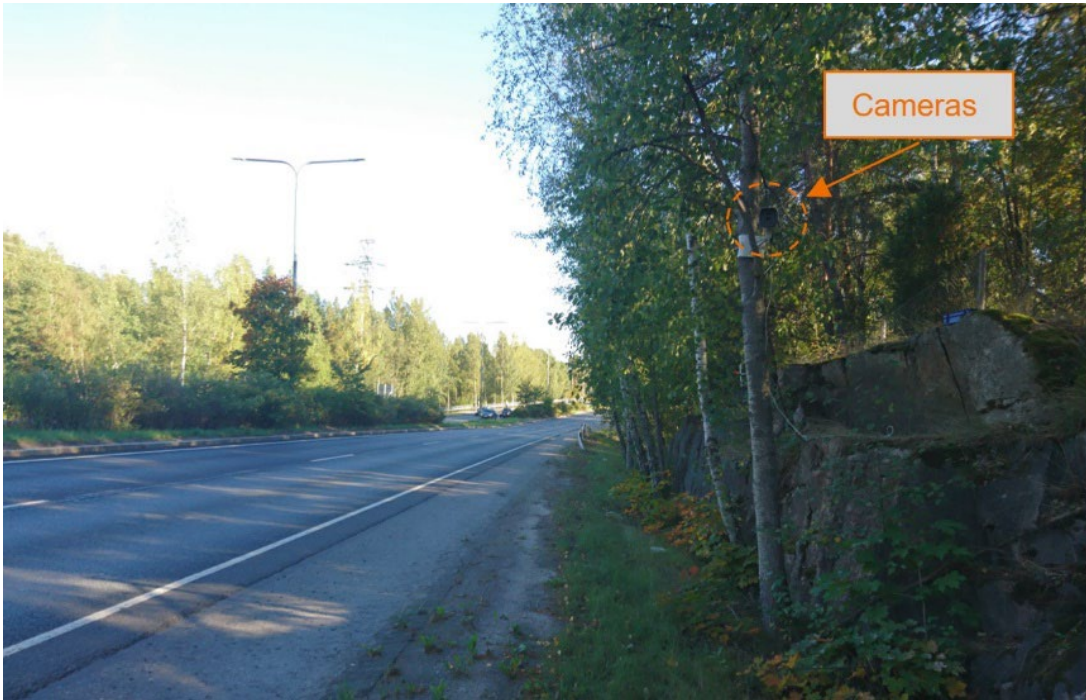
Figure 1. Example of location where the cameras were installed in a tree near the road.