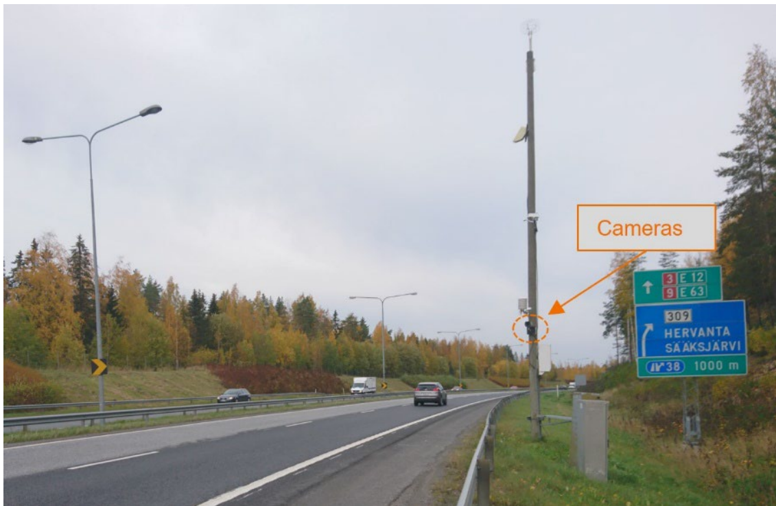
Figure 3. Example 3 of location where cameras were installed near road signs and in a pole with some other equipment.

The processing of pictures was done manually. However, an annotation tool was developed to speed up the otherwise labour-intensive process. The tool consisted of a graphic interface with keyboard shortcuts for the required classifications. The tool was created with Python and the open source QT5 software library. The identification of the vehicle type was done by the rater based on the pictures alone. The projection of the camera taking pictures of the cockpit was optimised to take pictures of passenger cars, hence a higher share of pictures of trucks and buses were unusable compared to passenger cars due to the glare from the windshield or interior being too dark.